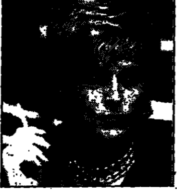
Sharon Stone: Princess-to-be?